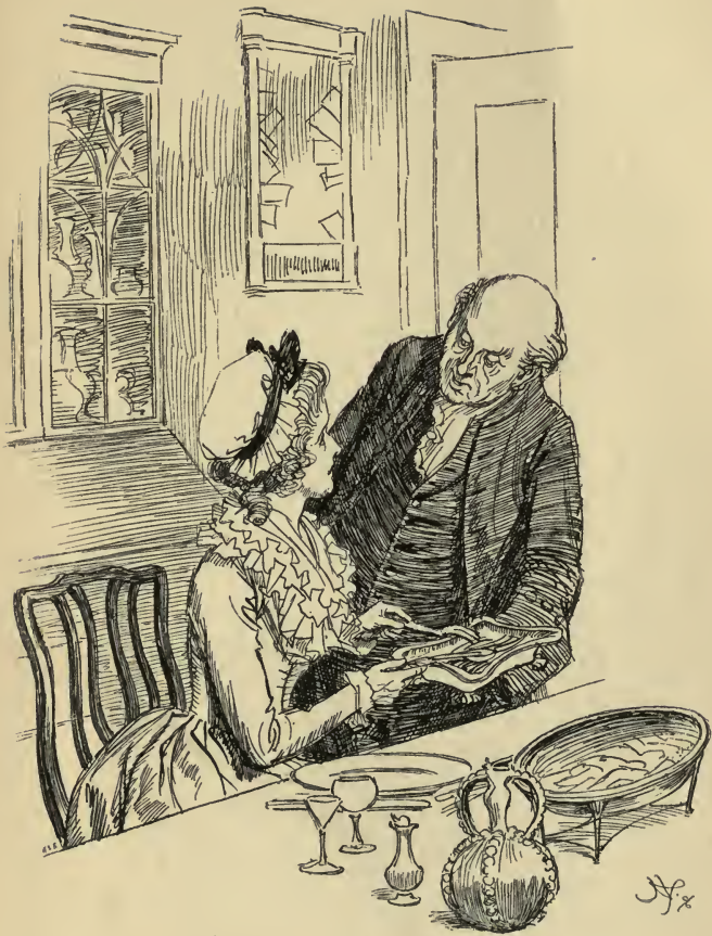
'I suppose you know, ma'am, that Mr. Ferrars is married.'